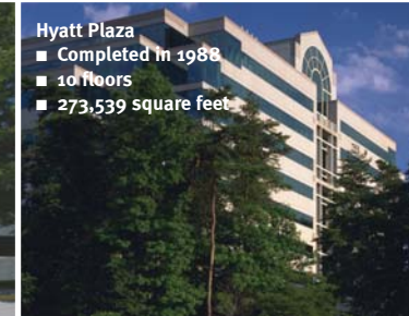
Hyatt Plaza ■ Completed in 1988 ■ 10 floors ■ 273,539 square feet