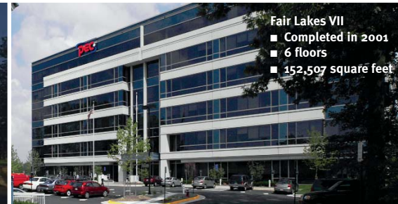
Fair Lakes VII ■ Completed in 2001 ■ 6 floors ■ 152,507 square feet