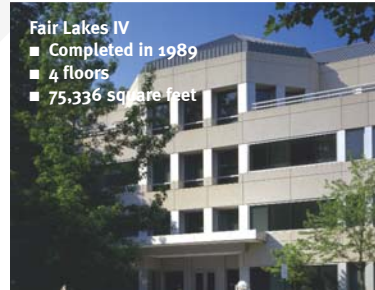
Fair Lakes IV ■ Completed in 1989 ■ 4 floors ■ 75,336 square feet