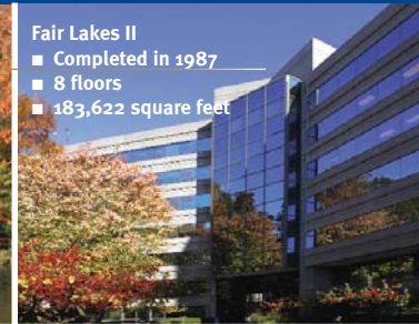
Fair Lakes II ■ Completed in 1987 ■ 8 floors ■ 183,622 square feet