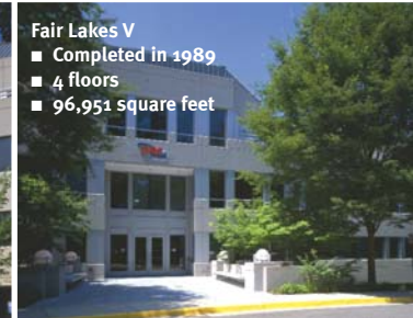
Fair Lakes V ■ Completed in 1989 ■ 4 floors ■ 96,951 square feet