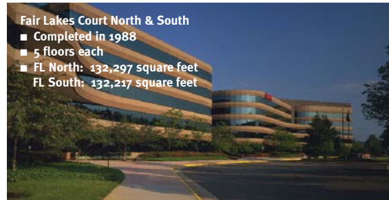
Fair Lakes Court North & South ■ Completed in 1988 ■ 5 floors each ■ FL North: 132,297 square feet ■ FL South: 132,217 square feet