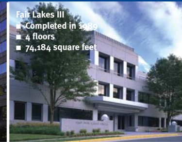
Fair Lakes III ■ Completed in 1989 ■ 4 floors ■ 74,184 square feet